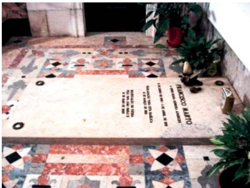
The tomb of blessed Francisco in the Basilica of Our Lady in Fatima

with Christ exclusively to console Him, by the simple act of standing with Our Lady under the Cross. While contemporary man no longer has time for the God who created him, and is so indifferent that he finds it boring to spend an hour with Christ, we at least should show our love for Our Lord by having a little time for Him to console Him with a loving presence and compassion. But what is the outcome of such an effort? This too is demonstrated by the example of little Francisco: in a very short time his love for God had reached a high degree of perfection, and a few months later he was already allowed to see the Immaculata forever in heaven.